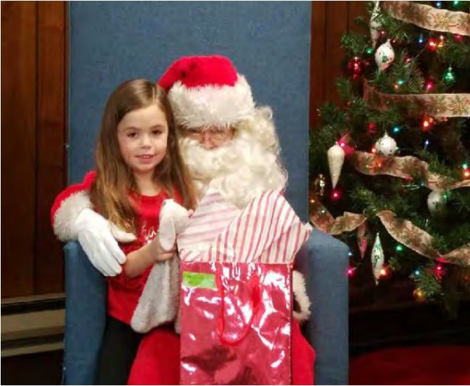
Santa hard at work!